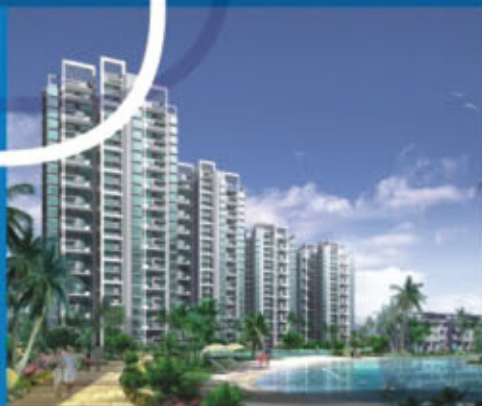
Immaculate elegance and flair for perfection gets a dazzling endorsement through Suncity I & II, Sun Paradise I & II Pune and Antriksh Apartment in Rohini, New Delhi.